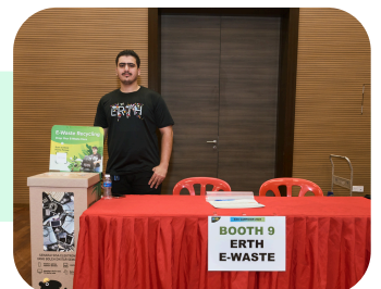
Electronic Recycling Through Heroes (ERTH)