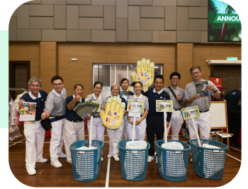
Yayasan Taiwan Buddhist Tzu-Chi Malaysia