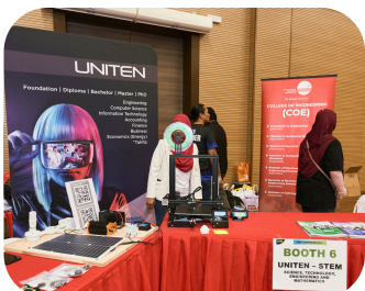
University Tenaga Nasional