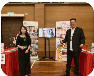
KAB's Sustainable Energy Solutions (SES)