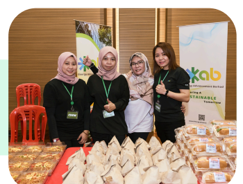
Food Charity Sale