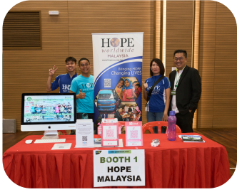
HOPE Worldwide Malaysia