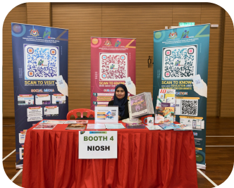
National Institute of Occupational Safety & Health (NIOSH)