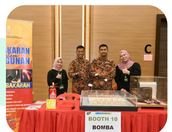
Sri Petaling Fire & Rescue Department